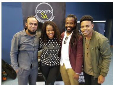
CONCERTS SA performances – page 4

The Mission of the South African Association for Jazz Education is to assure the growth of jazz in South Africa and the development of jazz and jazz education in urban and rural areas. SAJE is also dedicated to building the jazz arts community by advancing education, promoting skills development, performance and research, developing new audiences, archiving and preserving our great jazz heritage .