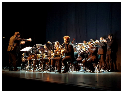
UCT Big Band – page 6