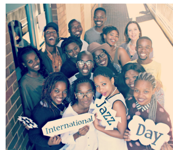
UKZN celebrates IJD – page 14